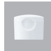
PHV flip top cap

ISH is PET bottle produced by injection stretch blow molding that this is squeezable and easy to discharge, because this is thin-walled, despite being a capped model.