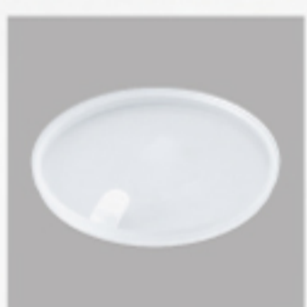
RUPIA-30 Inside lid (PE)