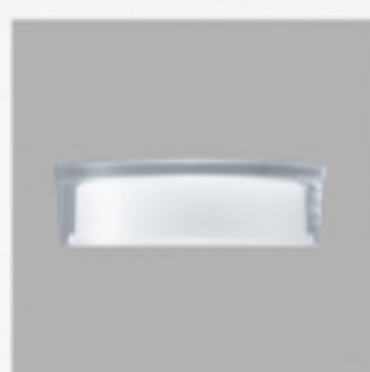
NOEL-30CAP (IN:PP OUT:AS)