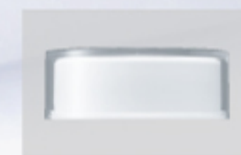
QUATRE-30 Double CAP ♻️* (IN:PP OUT:AS)

*Eco-friendly materials can be used only in PP.